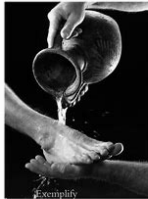
Exemplify Servant leadership that even the Son of Man did not come to be served, but to serve. — Matthew 23:11